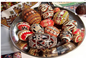
Easter Traditions Around the World