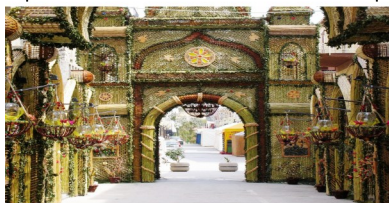
In the city of San Biagio Platani, people build Archi di Pasqua or Easter Arches. These are large, building-like structures people can walk under made entirely of bread and other foods.