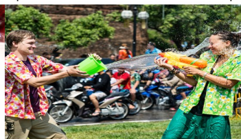
On Easter Monday, some Polish people celebrate Śmigus-Dyngus or Wet Monday. People will sneak up on and drench each other with water using glasses of water or even squirt guns!