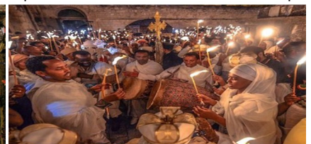
People fast from all meat products for Fasika, the 55 days leading up to Easter Sunday in Ethiopia. They break their fast at Easter Supper, a feast even more popular than Christmas dinner there!